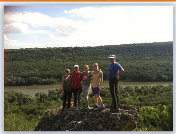
Youth Social Adaptation Service

11 For when the ear heard me, then it blessed me; And when the eye saw me, it gave witness unto me: 12 Because I delivered to poor that cried, The fatherless also, that had none to help him. Job 29:11-12 ASV.