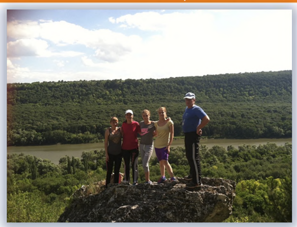
INDEPENDENT LIFE PROGRAM

11 For when the ear heard me, then it blessed me; And when the eye saw me, it gave witness unto me: 12 Because I delivered to poor that cried, The fatherless also, that had none to help him. Job 29:11-12 ASV.